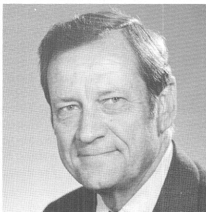
James P. Grant

It was a time for grappling with world-class issues in the organized sessions, for informal conversations among people representing many cultures and fields of knowledge, for networking and organizing, for reminiscing about the Academy's rich past and making plans for its future activities in the late 1990's and the twenty-first century.