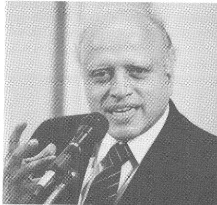
Dr. M. S. Swaminathan

and Food. The commission, a group of world leaders from 15 countries, has been working for five years under the sponsorship of the UN Development Program, and its report -- entitled Uncommon Opportunities: An Agenda for Peace and Equitable Development -- was released publicly at the Assembly. In his acceptance remarks, Dr. Swaminathan noted that the major transformations taking place in the world today -- such as the growing democratization of societies, the increasing concern for the environment and the changing status of women -- are all presenting the global community with great problems, but at the same time with uncommon opportunities to bring about major improvements in the human condition.