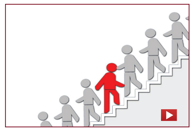
Individuality and Values in Social Evolution

The video recordings of the previous WUC-WAAS organized courses are available on the WUC website. Interested participants can apply for a certificate of participation by contacting the WAAS administrative team.