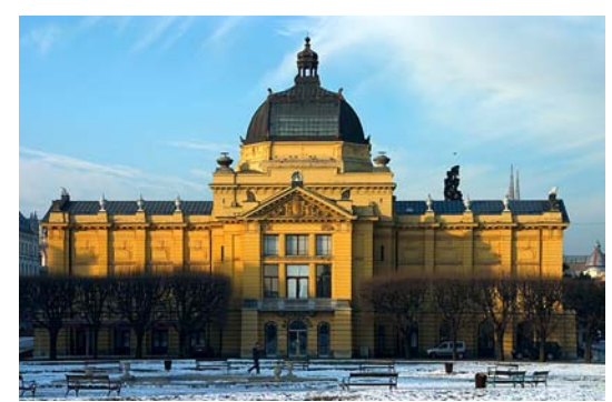
Art Pavilion, Zagreb