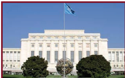
UN Palais des Nations, Geneva

The world is beset by multiple problems that are pressing. Humanity has identified, catalogued and analyzed them exhaustively. But we struggle in the search for viable, comprehensive, lasting solutions. Piecemeal remedies are innumerable but insufficient, for the effectivity of each is constrained by external conditions. Is there any approach that can effectively address the multiple challenges facing humanity today?