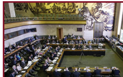
Council Chamber, Palais des Nations

The world is beset by multiple problems that are pressing. Humanity has identified, catalogued and analyzed them exhaustively. But we struggle in the search for viable, comprehensive, lasting solutions. Piecemeal remedies are innumerable but insufficient, for the effectivity of each is constrained by external conditions. Is there any approach that can effectively address the multiple challenges facing humanity today?