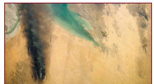
Oil Fires, Kuwait

How can we tackle the challenges of climate change from the cultural sphere? The second award of the Cultural Innovation International Prize encourages projects that offer imaginative and effective solutions to one of the biggest global problems of the 21 st century. The Prize is open to cultural innovative projects that raise awareness about climate change. The proposal must empower and involve society actively in commitment to environmental responsibility. The winning project will be included in the exhibition "After the End of the World" (October 2017). For more information, please click here .