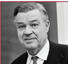
Gunnar Myrdal (1898-1987) WAAS Fellow & Nobel Laureate in Economics

“The social sciences emerged some two hundred years ago from the metaphysical, and more precisely teleological, philosophies of natural law and utilitarianism. In these philosophies objective values were supposed to exist, i.e., to be facts and to be ascertainable.