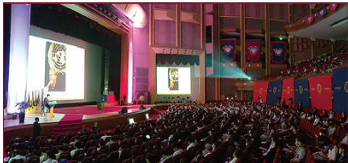
Peace BAR Festival 2016

The work of the Academy on the multidimensional crises confronting humanity today points to the need for new approaches and concerted action at six different levels of social existence. It requires a radical shift in policies toward sustainable human security, welfare and well-being; democratization and strengthening of the institutions for global governance; more transparent, equitable distribution of social power; formulation of integrated, transdisciplinary social theory; shift to active, value-based, student-centered, customized education focusing on development of personality and individuality; and, at the deepest level, founded on more integrated, creative modes of thinking capable of comprehending the intricate complexity and organic unity of existence. While most attention has been given to effective policy and institutional reform, these are not sufficient. Effective action also requires change at all the deeper levels.