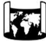
Primary Sources & Datasets