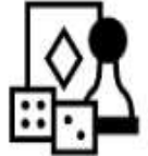
Games & Simulations