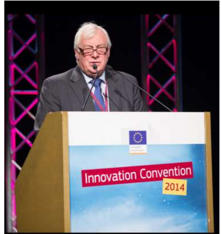
Chris PATTEN of BARNES Chancellor of Oxford University, United Kingdom

We want to be able to learn Anything, Anytime, Anywhere. At our pace, at our place.