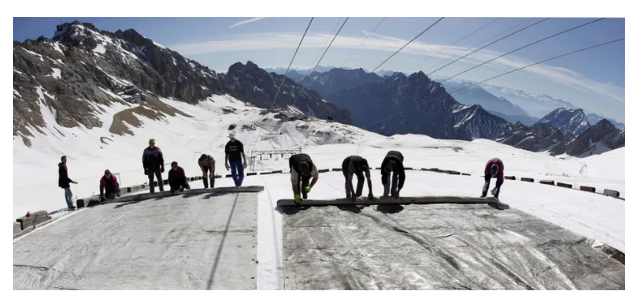
Workers cover a glacier with plastic sheets in southern Germany, in an attempt to stop it melting - an effort in geoengineering to mitigate climate change.

STEAM inserts arts into the acronym for STEM (science, technology, engineering and math). I chose to frame the arts more widely to include the humanities, and asked the attendees: How do we identify the challenges we wish to work on?