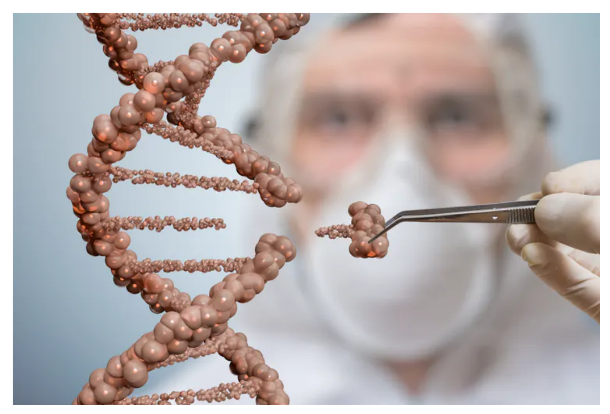
Genome editing technologies offer hope for treating many human diseases. They also raise vast ethical questions.

It's as if we've encountered several simultaneous Manhattan Projects through the application of military DARPA funding, venture-capital investment and advancements in cloud-computing. We are seeing a whole host of life-changing technologies come to fruition after decades of basic research and the rapid prototyping tools and production pipelines of the modern era have let us scale these new inventions faster than ever before.