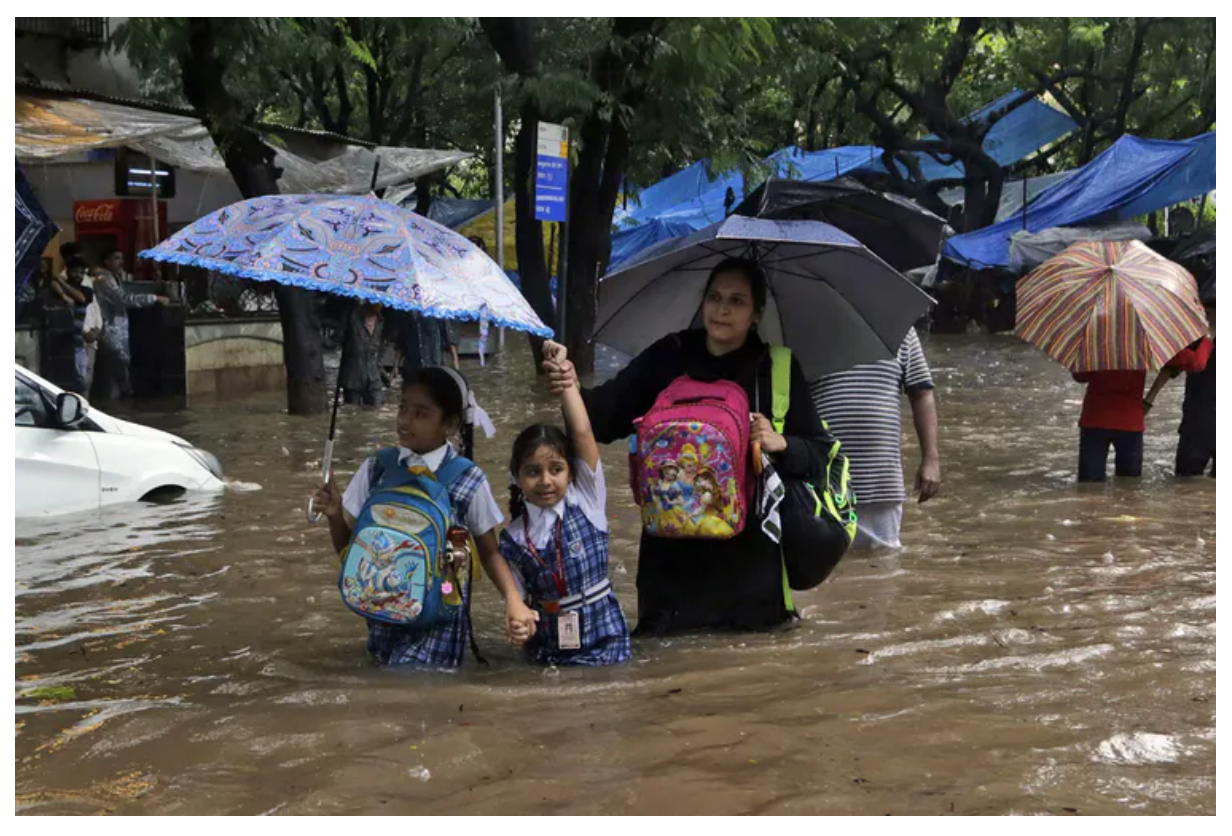
Will technology mitigate climate change, or cause new global imbalances? Here, schoolchildren wade in floods in Mumbai, India.

Action can be important, and even governments, not known for agile movement, are starting to embrace learning-through-doing. Finland, for example, has a department of experimentation which aims to bring design-thinking experimentation into policy work.