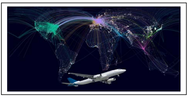
Fig.3 A hypothetical map of the flight routes of all planes in an airline company