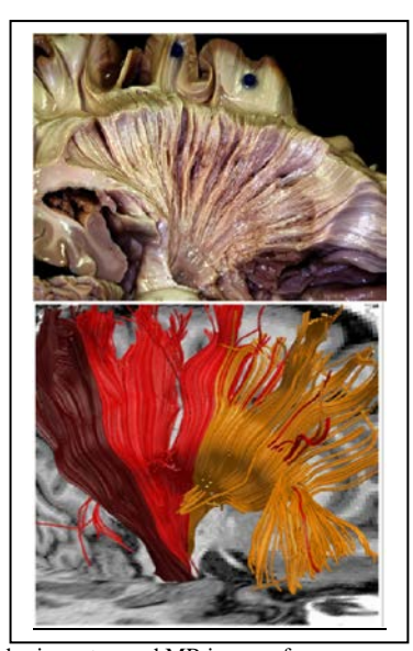
Fig. 2: Cadaver brain on top and MR image of same area post-operatively following the resection of a tumor on the bottom.

Such constant change and complexity makes it extremely challenging to examine each neuron individually, so scientists simplify them into clusters based on function to examine these electrochemical rivers. In Fig. 2, in the top picture, there is a cadaver and on the bottom is the MR image of the same area after that same region has been operated on. Each fiber is an electrochemical river made up of about 200 to 300 million neurons. This shows the flow of information. Therefore, function also forms anatomy. But a look into the system made up of the neurons would offer a much more detailed image than this. Each fiber here is actually merged functional units.