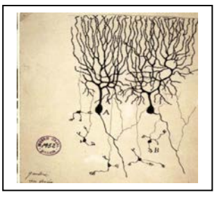
Fig. 1: Cajal's drawing of the neuron.

The Human Connectome Project (HCP), which began in the US in 2009, aims to map the neural network to elucidate the anatomical and functional interconnectivity of the healthy human brain to create data that would support research into conditions such as dyslexia, autism and Alzheimer's disease [2]. The data obtained through the cooperation of dozens of researchers are available to the public on an internet based neuroinformatics platform [2]. Europe's response to the same research goal, but from a more mathematical perspective, the Human Brain Project (HBP) was initiated within the EU in 2013 [3]. As one of the largest collective efforts to explain the brain, the HBP tried to understand how information flows through it and whether a supercomputer can be built that can simulate the human brain. The project involved the most sophisticated computers with an eye to building a scientific research platform for scientists all over Europe in fields related to neuroscience, information processing and neuroscience.